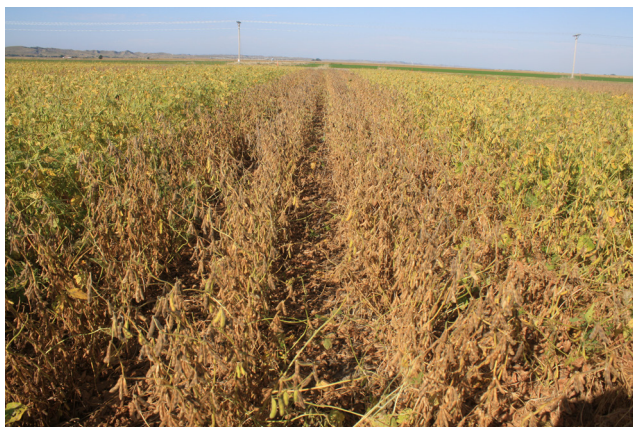
Figure 2. Image of the 2.0MG product in the +Boron fertigation treatment.